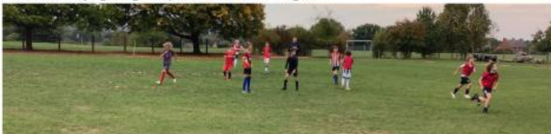
[Text Wrapping Break] Year 2 went to Altwood to take part in the Active 60 festival, with other schools in the area.

The morning was to promote and give children the opportunity to try new skills and keep active!