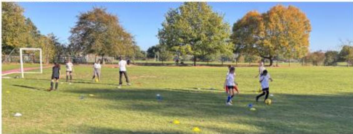
Year 5 & 6 boys getting competitive in their training...