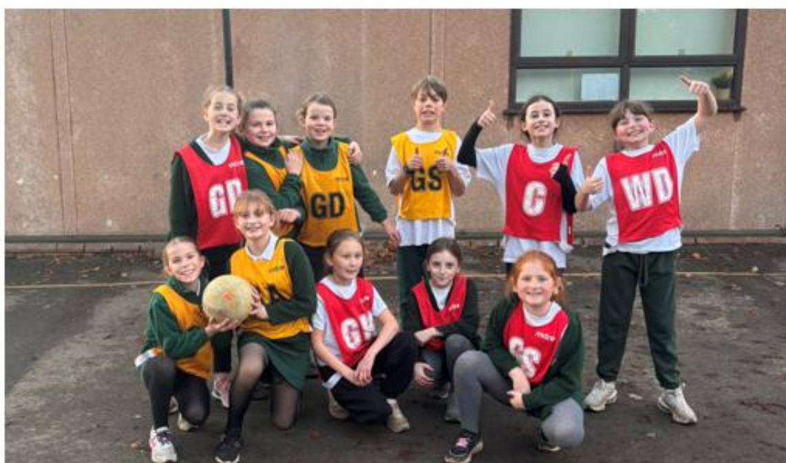
Our fabulous 5 and 6 netballers, I forgot to take pictures at their match last week!