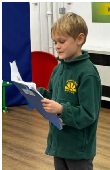
Children and staff sharing poems during Young Poet's Week.